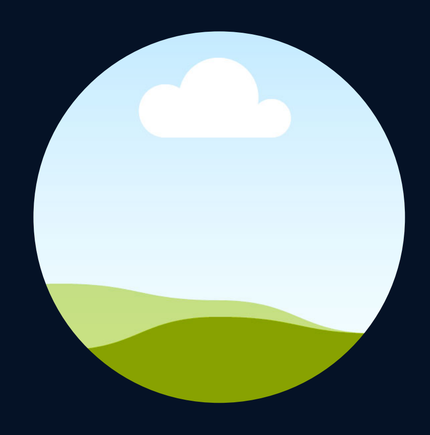
NAME DEPUTY SECRETARY GENERAL